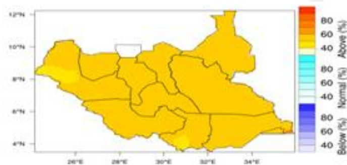
Fig3. MAM2026 Temperature forecast for South Sudan